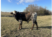
G5 W.B.'S TEMPEST

This steer was named in honor of one of the best Christian men we ever knew. What makes this little stud so special, aside from his name, should be obvious to anyone who knows anything about longhorns: his pedigree is stacked taller than an XL flapjack order, his coat is just about more varied than an '80s boy band wardrobe, and his horns are expected to grow, and grow, and grow. We expect exceptional things from this special